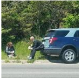
Photo of trooper sharing meal with woman in need spreads widely

A passerby captured an image of a State Trooper in Fall River sharing a meal with a woman in need. MORE...